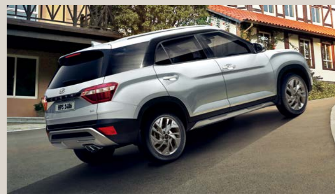
Hillstart Assist Control When starting from a stop on a hill, HAC prevents the unintentional rollback that can occur after the brake pedal is released.