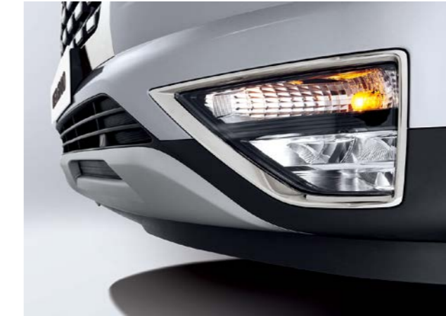
Front fog lamps (LED MFR)