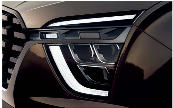
LED headlamps with LED DRLs