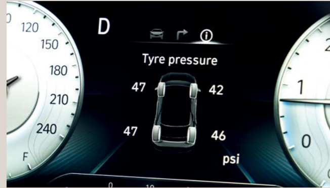
Tyre Pressure Monitor System (TPMS) TPMS helps you achieve optimal fuel economy and extends tire life by alerting you if the tires require attention.

Though the road ahead is filled with uncertainties, CRETA GRAND's advanced safety systems provide you with complete peace of mind. Special crush zones serve as your first line of defense. Made of ultra-high tensile strength steel and embedded in critical areas, these structures are designed to safely absorb impact forces and protect cabin occupants in the event of a collision. The Blind Spot View Monitor always looks over your shoulder and will alert you if you try to make an unsafe lane change.