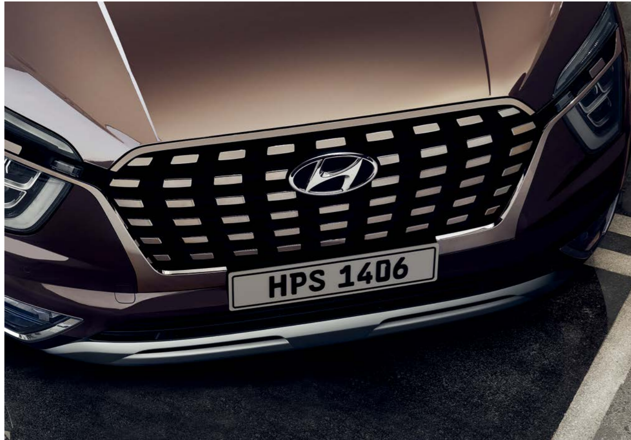
Signature cascading grille with dark chrome finish

Modern, sporty, and masculine—it's just my style, it's in perfect tune with my sensibilities, and it fits in anywhere. From any angle, CRETA GRAND projects supreme confidence and authority. Your fascination only grows as you move in closer to examine the details: The LED lighting, the strikingly-designed diamond-cut alloy wheels, and the catchy-looking radiator grille. But the real centre of attention and even greater delights await you inside.