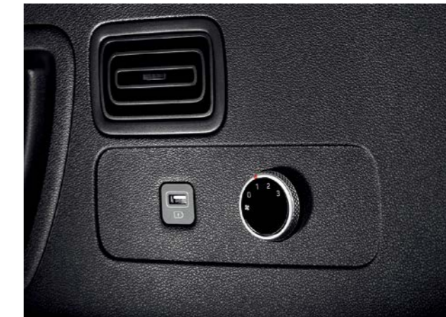
3rd-row AC vents with 3-speed fan control

* Features and specifications vary by market. Please consult your local dealer.