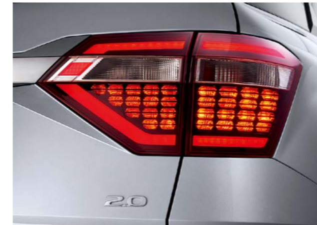
LED rear combination lamp