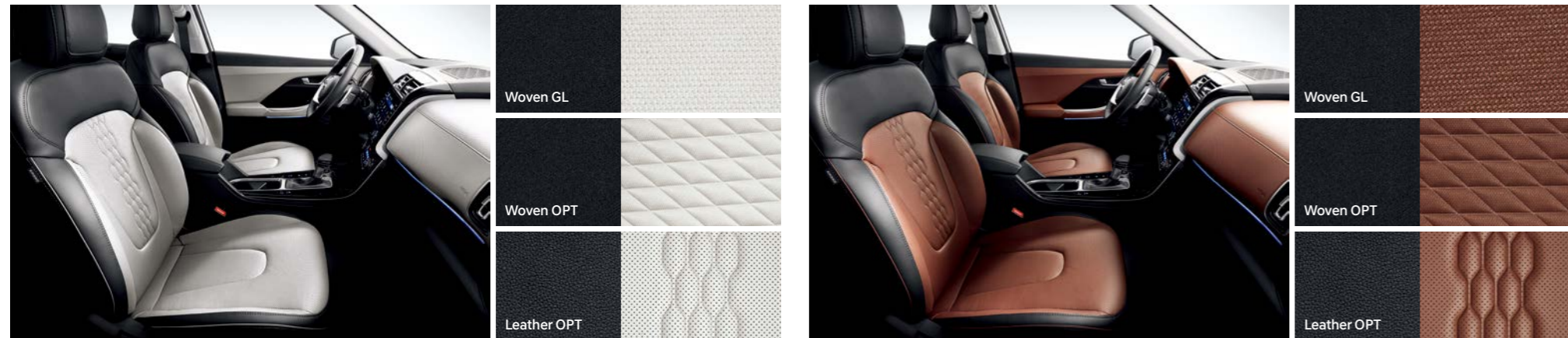
Black / Gray two-tone interior