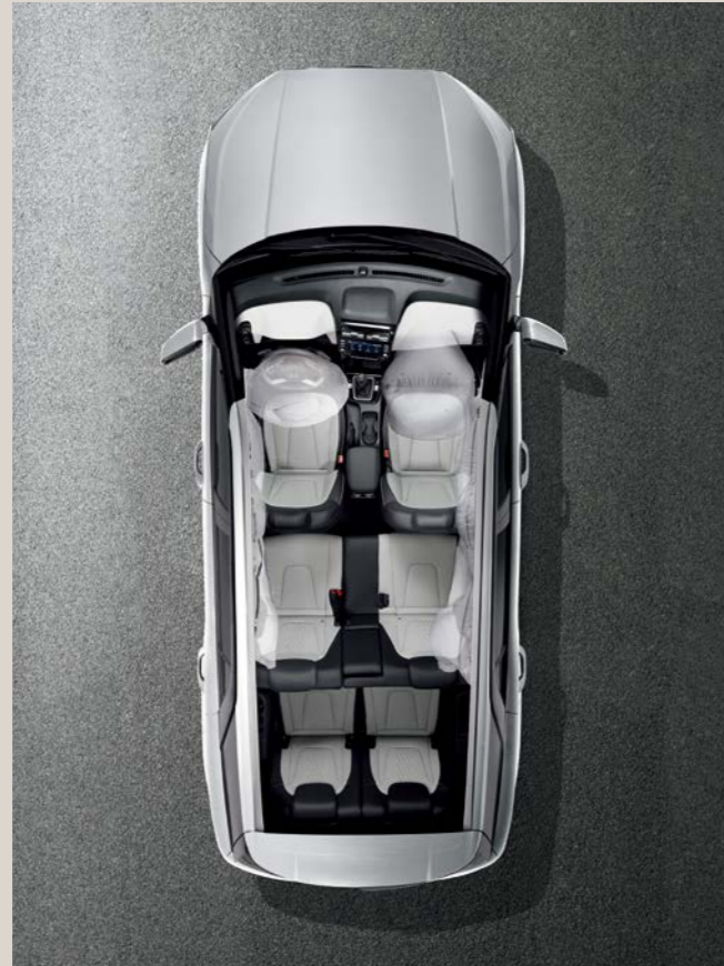
6-airbag system (Driver, Passenger, Side & Curtain) CRETA GRAND offers 6 airbags: the driver and front passenger get a pair of front airbags plus a pair of side airbags to protect the thorax and pelvic areas while left and right curtain airbags offer head protection for all cabin occupants.