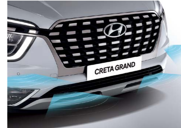
Front distance warning