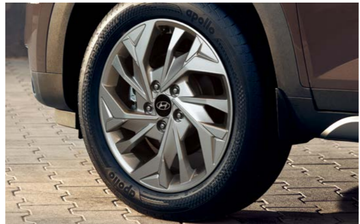
18" diamond-cut alloy wheels