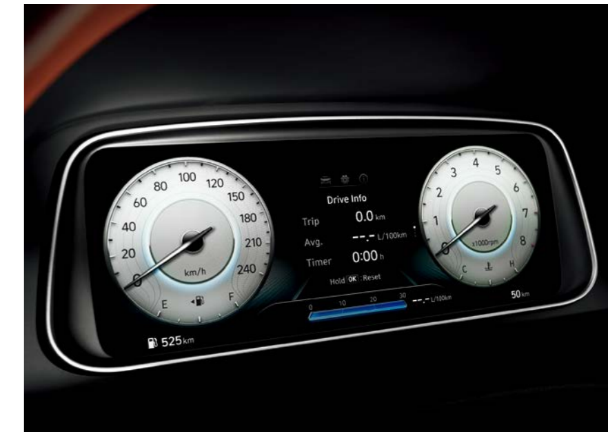
10.25" TFT LCD cluster