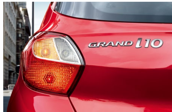
Distinctive G-i10 logo Wraparound rear combination lamps