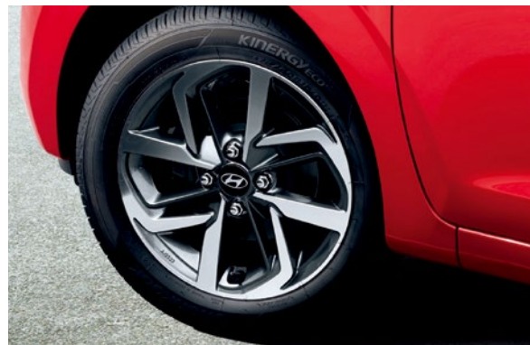
Projection headlamps / LED Daytime Running Lights (DRL) 15" Diamond-cut alloy wheels