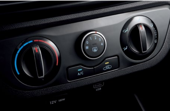
8" touchscreen Manual air conditioning system