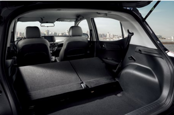
Supervision cluster Folding rear seat