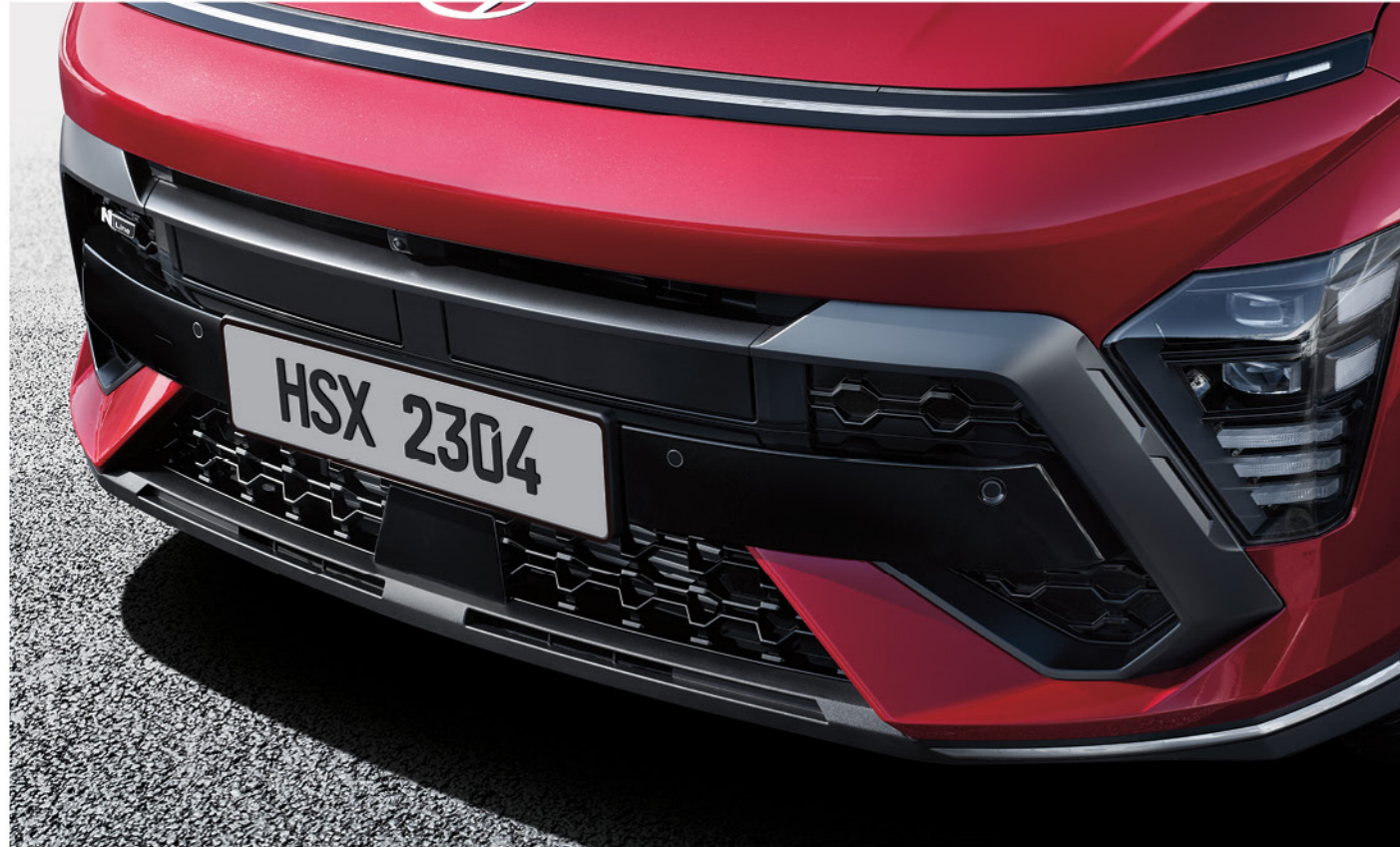
N Line-exclusive front bumper & bumper skirt

The N Line exudes boldness and dynamism, featuring a high-performance exterior design inspired by the renowned high-performance N.