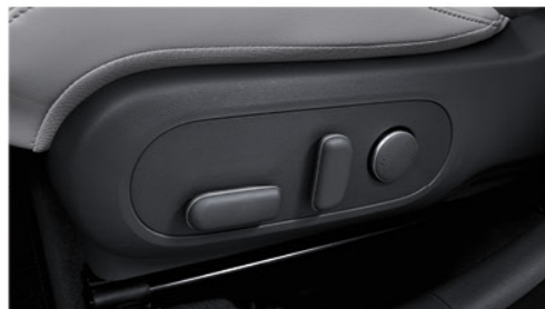
Powered driver seat