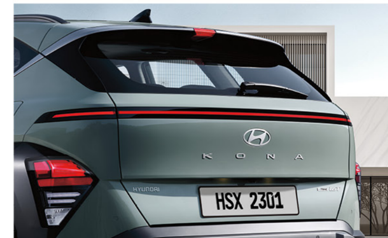
Spoiler Integrated HMSL, rear seamless horizon lamp LED brake lamps, LED turn signal lamps