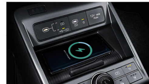
USB-C Data/Charging ports /Wireless charging pad