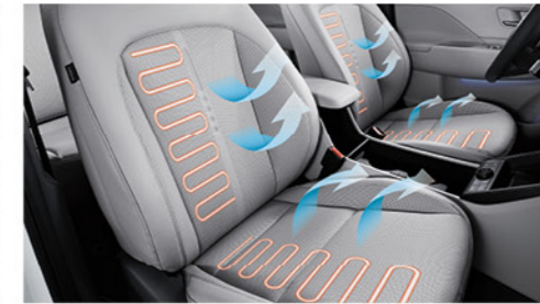
Heated & Ventilated front seats