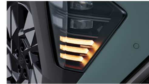
LED turn signal indicators (front/rear)