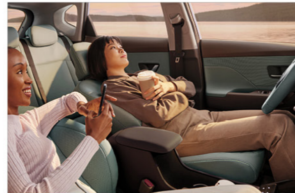
1st-row relaxation comfort seat