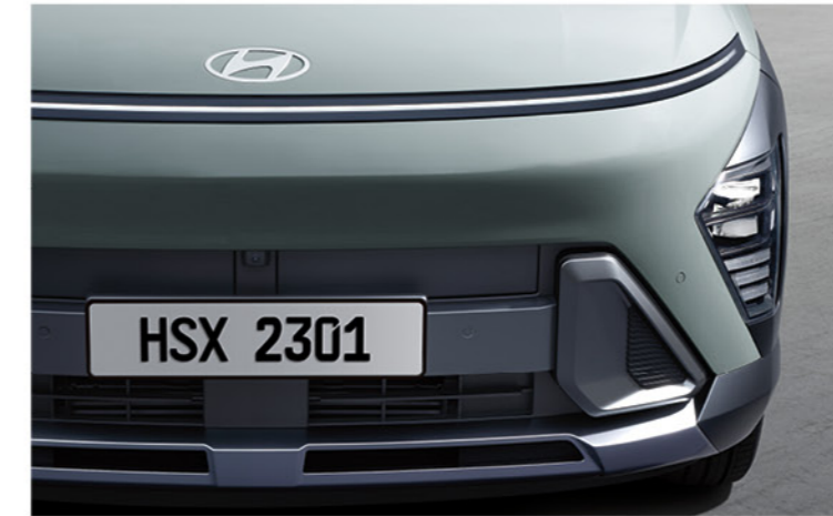
Front seamless horizon lamp, front bumper