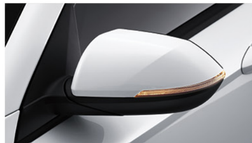
Outside mirror (Heated / Folding / Turn signal indicator LED)