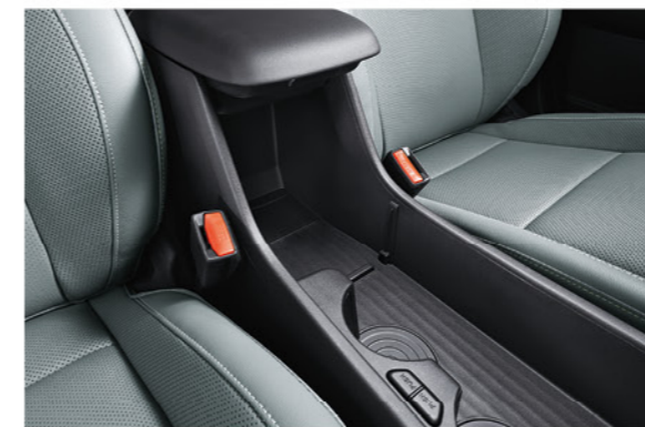
Open console storage (removable bulkhead / rotational cup holders)