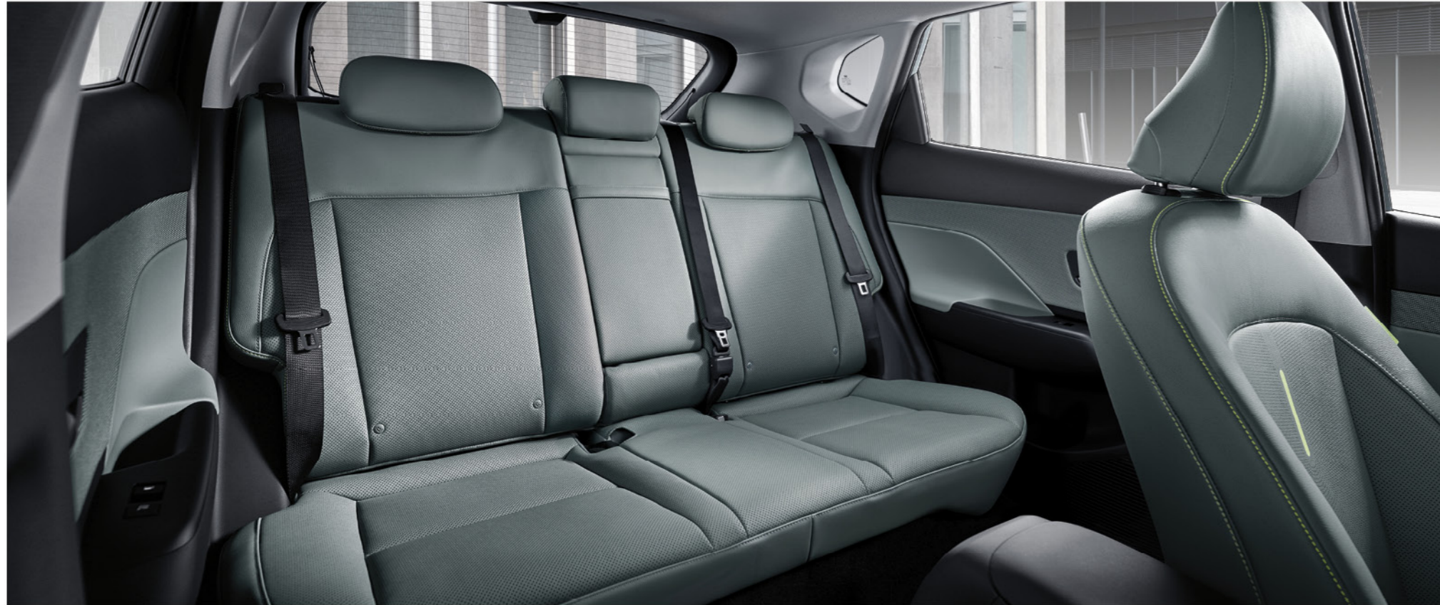
2nd row space

KONA's interior is practical and spacious, with a focus on the comfort of rear passengers and ample luggage space to cater to different lifestyles.