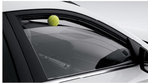
Safety power window