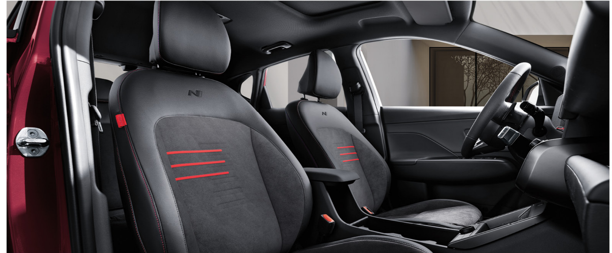
N Line-exclusive authentic leather / Alcantara combination seats