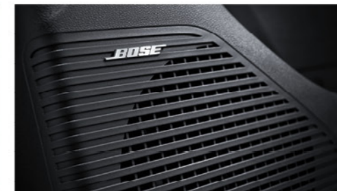
Bose premium audio system