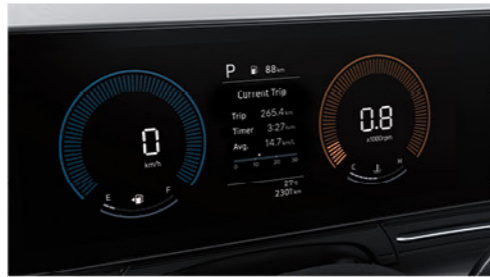
Cluster display (4-inch color LCD)