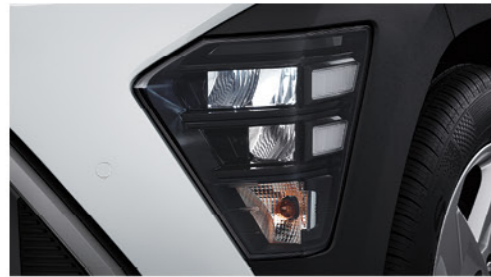
LED Headlamps (MFR)