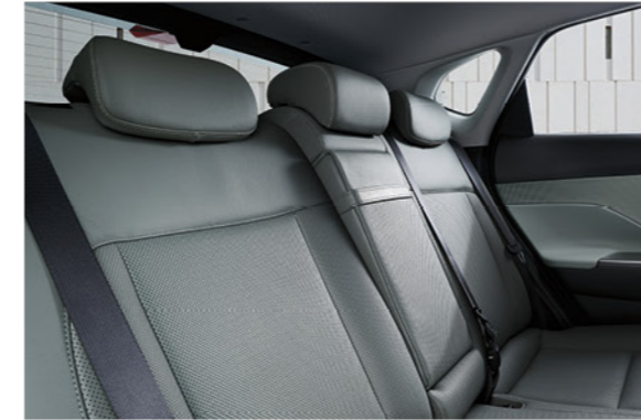
2nd-row seatback 2-step latch