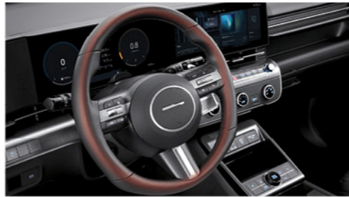
Heated steering wheel