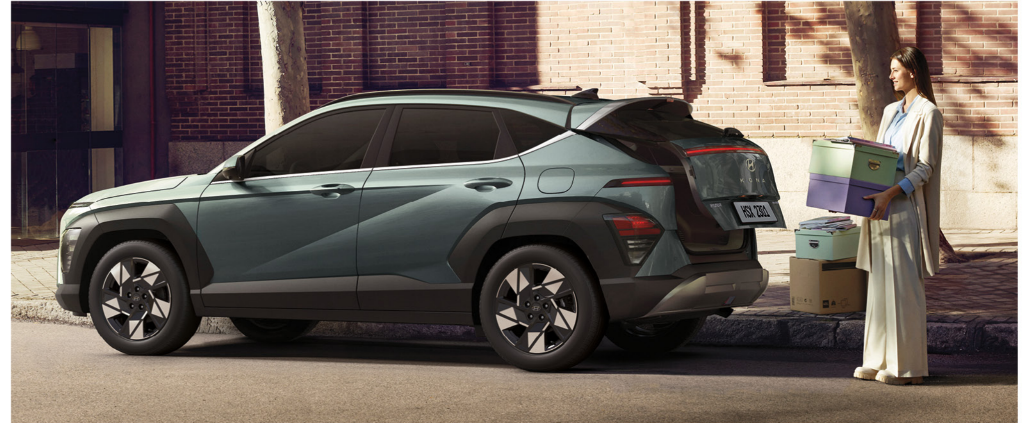
Smart power tailgate - Hands-free smart liftgate with auto-open and adjustable height setting