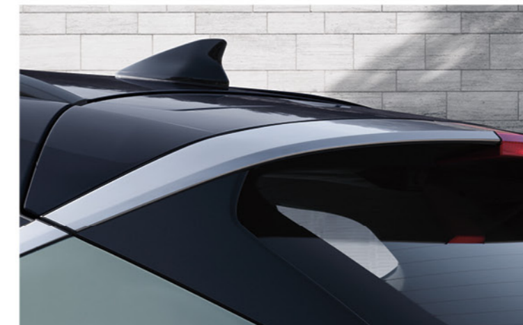
Dual tone roof, sharp connecting chrome line