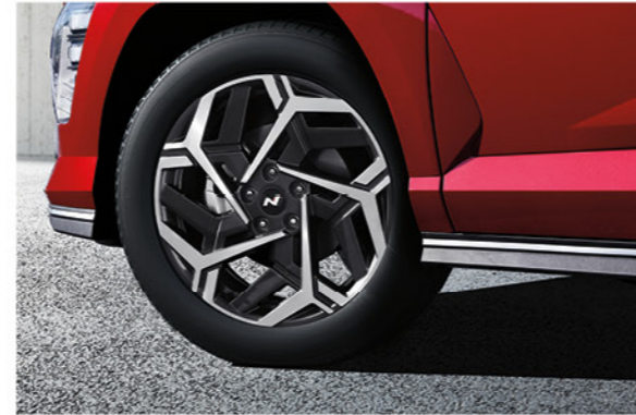
N Line-exclusive 18-Inch alloy wheels / Body-colored cladding