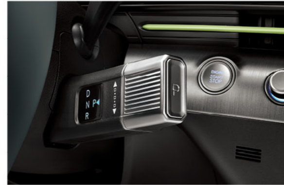
Column-Type Shift by Wire (SBW)