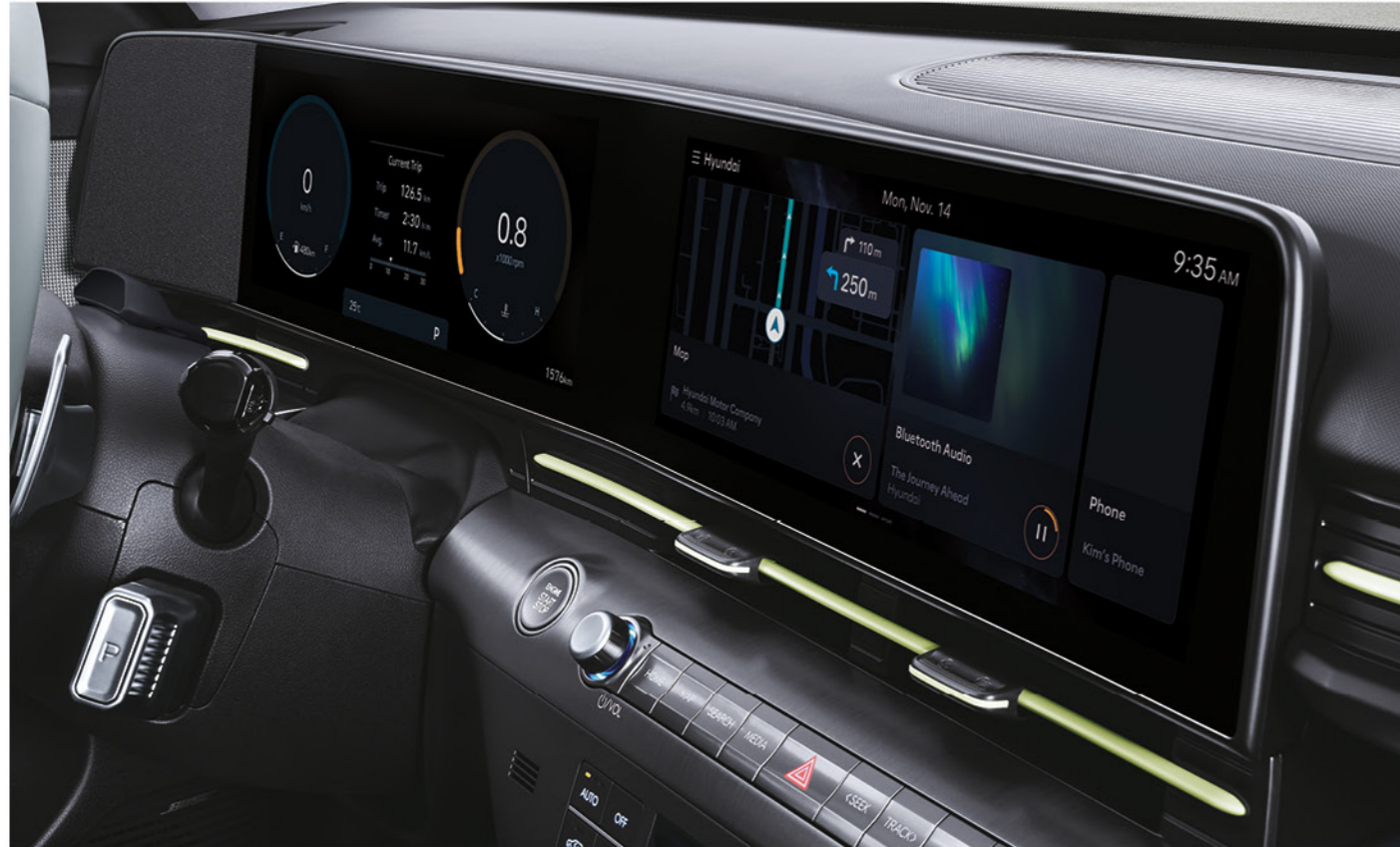
Panoramic display - 12.3-inch integrated dual screen display

The panoramic display - 12.3-inch integrated dual screen display and cutting-edge driver assistance technology offer high-tech convenience and increase user satisfaction in daily use.