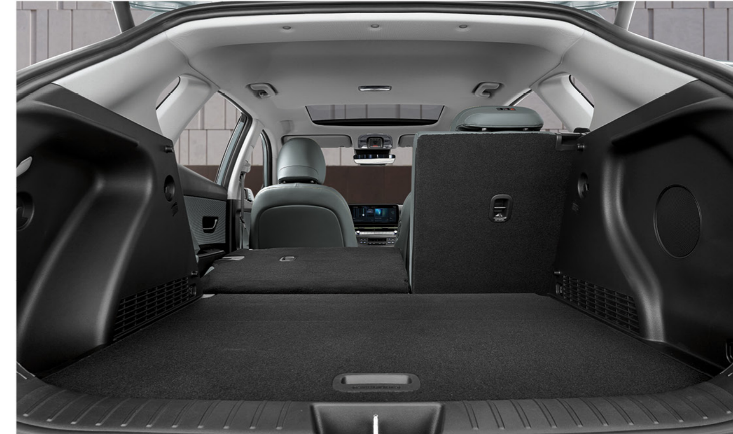
6:4 folding 2nd row seat backs