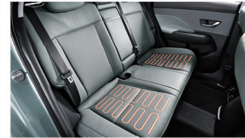
Heated rear seats