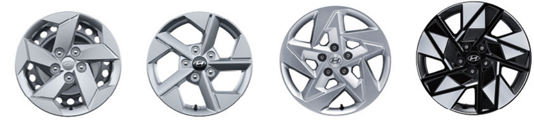
16" Steel wheels