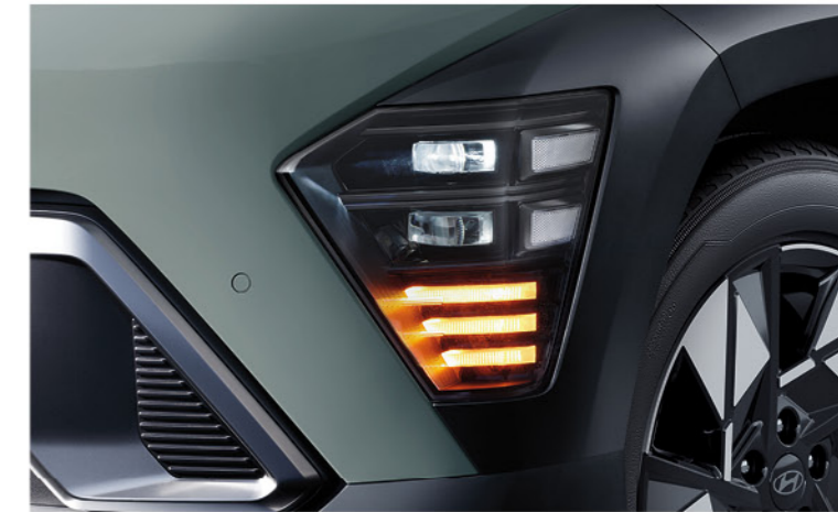
Full LED headlamps (projection type)