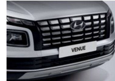
Dark chrome grille