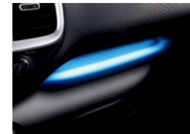
Ambient mood lamp