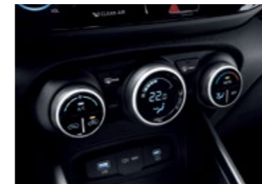
Full auto air conditioning system