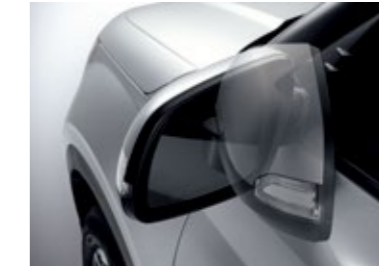
Electric folding mirrors