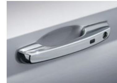
Chrome-coated door handles