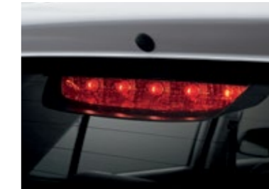
High-mounted stop lamp