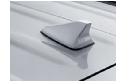
Shark fin antenna