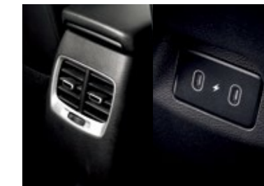
Rear air vent & USB charger (2port)

* Features and specifications vary by market. Please consult your local dealer.