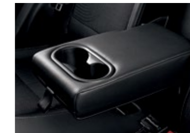
Center rear armrest with cup holders