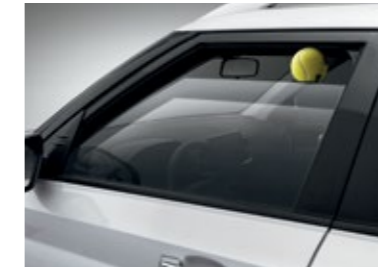
Safety windows (Driver)