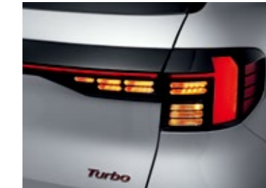
LED rear combination lamp