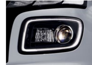
LED MFR headlamps & LED DRLs