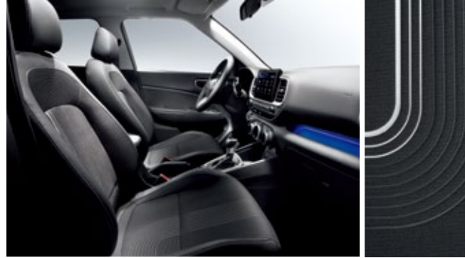
Black one-tone (Woven, Patch + Emboss)