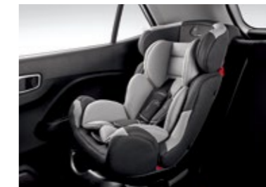
Child anchor system