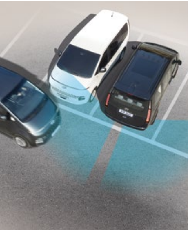
Rear Cross-Traffic Collision-Avoidance Assist (RCCA)

A front camera tracks the lane markers and helps keep the vehicle safely centered within the lane.