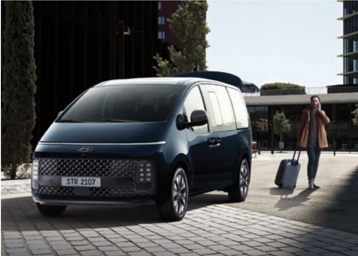
Smart power tailgate (with auto-close function) If you can't reach into your pocket for your smart key because your hands are full, STARIA's smart power tailgate does all the work for you by automatically opening as you approach the vehicle and automatically closing as you walk away.

* Premium 9-seater, 11-seater (wagon) only