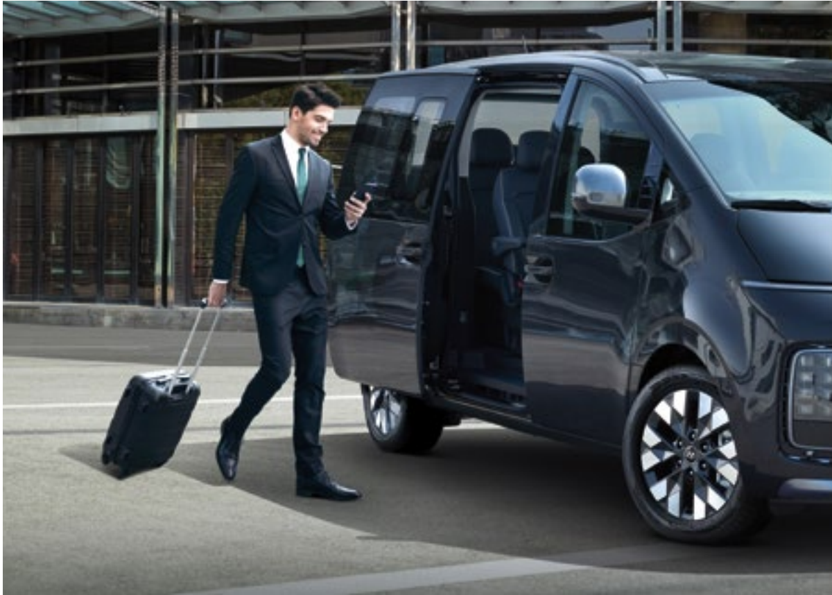
Smart power sliding door No hands, no button pressing required. The smart door senses your presence and slides open automatically (as long as the smart key is on your person).

Crafted for peak comfort and convenience, STARIA Premium gets it right by surrounding you with a variety of smart features that provide unexpected delight. The sliding door and tailgate open and close automatically on your approach and departure. Long sliding seats provide an extra measure of flexibility for reconfiguring the cabin space while the BOSE premium sound system transforms STARIA Premium into a concert hall on wheels.