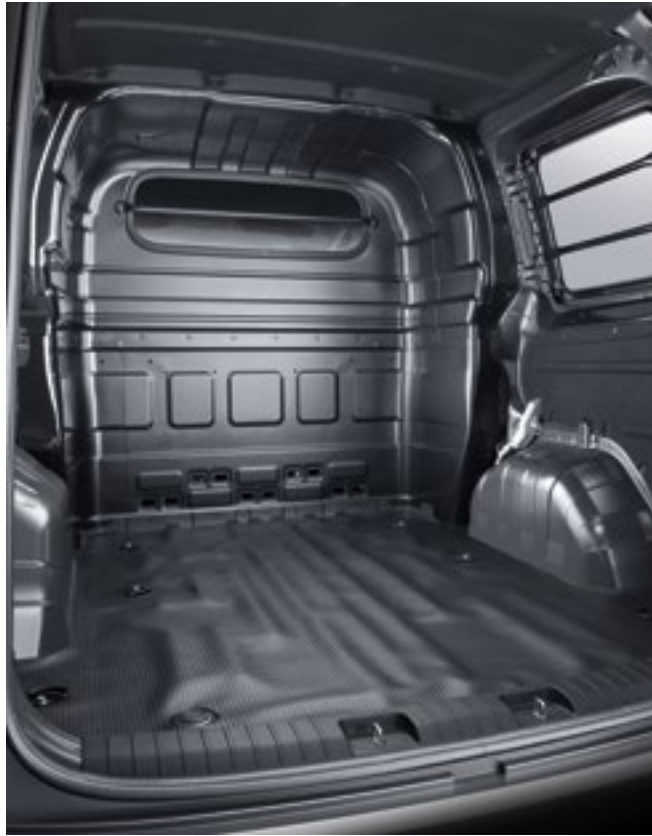
5/6-seater window van cargo space