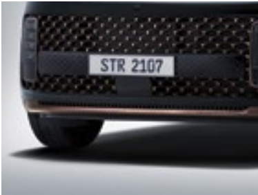
Tinted brass chrome bumper