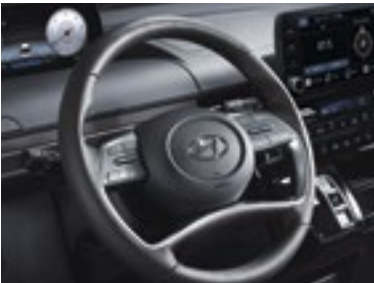
Semi-punched leather-wrapped steering wheel