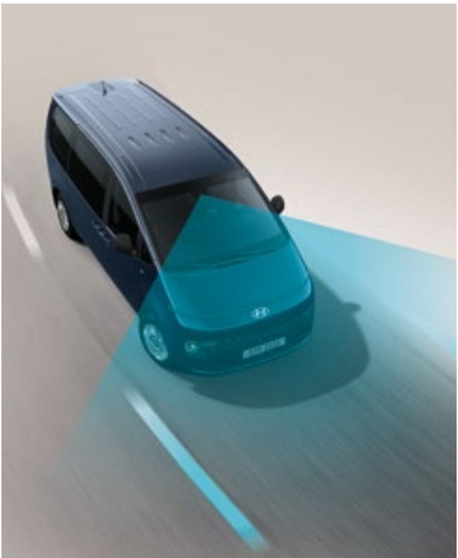
Lane Following Assist (LFA)

Smart Cruise Control helps maintain distance from the vehicle ahead and drive at a speed, set by the driver.