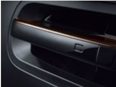
Touch-type outside door handle (1st row)