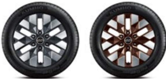
18" dark gray alloy wheels 18" tinted brass alloy wheels