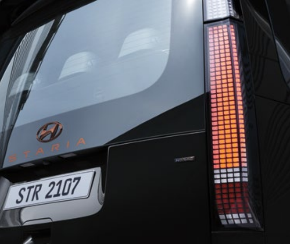
Parametric pixel lights (LED rear combination lamp) / Tinted brass chrome