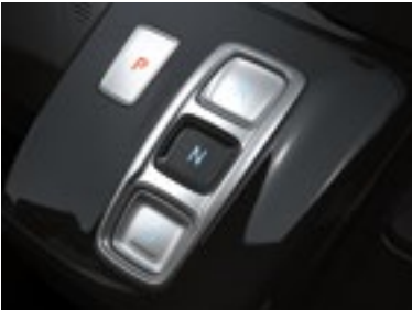
Shift-by-wire automatic transmission