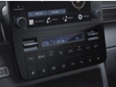
Full-auto air conditioning system