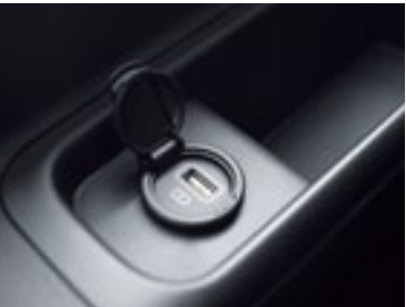
USB outlets at all seats (wagon only)