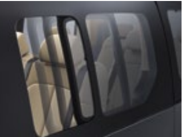
Flush glass (optional)