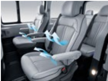
2nd-row ventilated seats