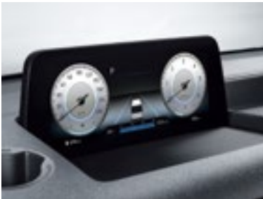
10.25" cluster (optional)