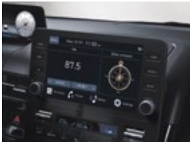
8" display audio