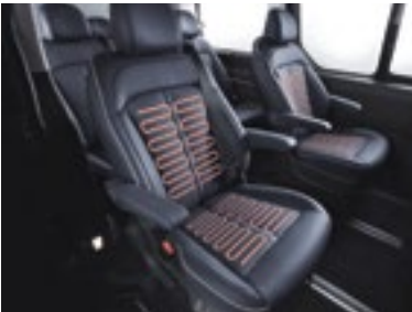
2nd-row heated seats