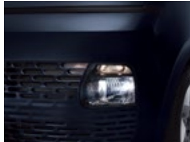
Bulb MFR headlamps (standard)