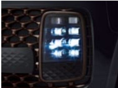
Full LED headlamps