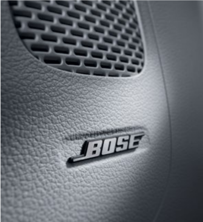
BOSE premium sound system (Premium option) Bose speakers create a truly immersive sound experience and include dynamic speed compensation to automatically calibrate speaker volume according to your driving speed.