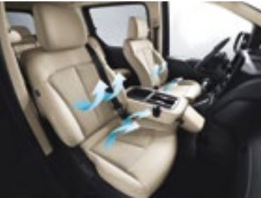
1st-row ventilated seats