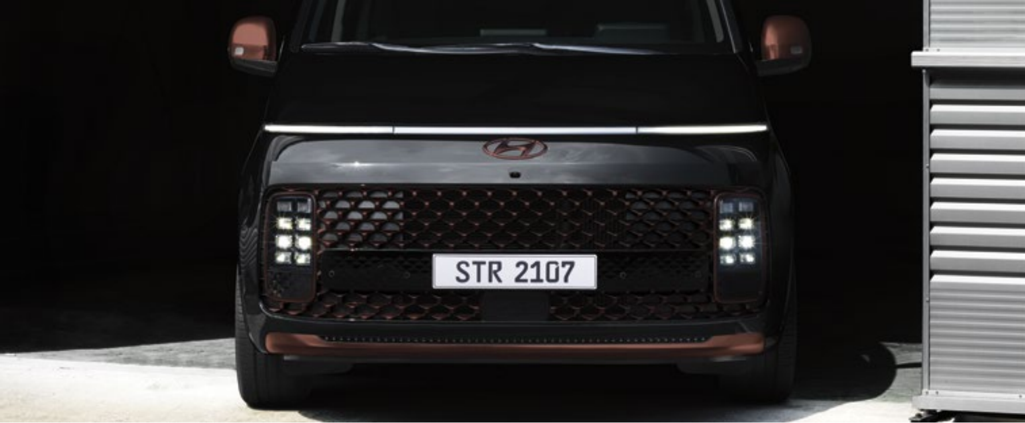
Full LED headlamps / Tinted brass chrome