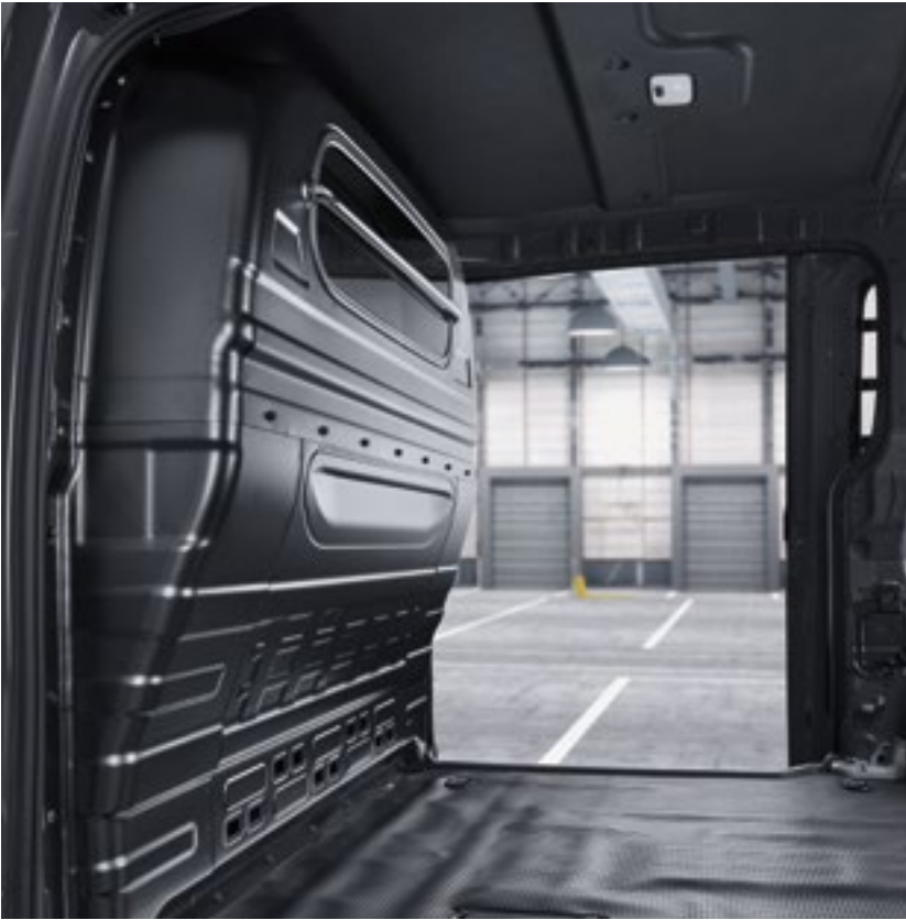
Passenger / cargo space bulkhead