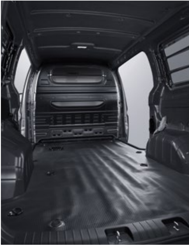
3-seater panel van cargo space