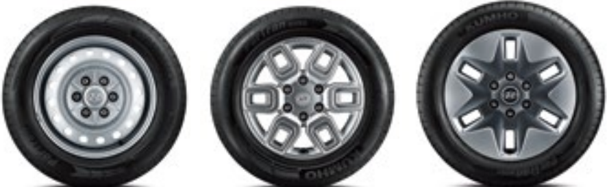
17" steel wheels 17" alloy wheels 18" alloy wheels (wagon only)