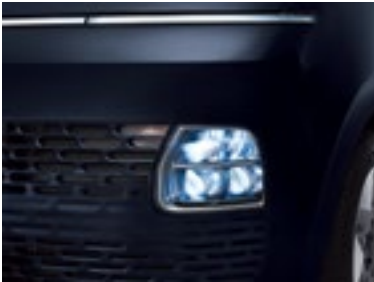
LED headlamps (optional)