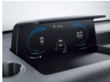
4.2" cluster (standard)