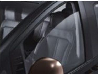
1st-row double-laminated soundproof glass