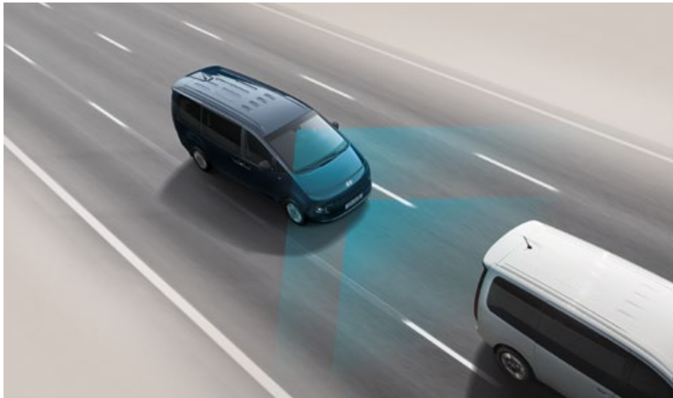
Forward Collision-Avoidance Assist (FCA)

If there's a danger of a collision with a car, pedestrian, or cyclist, FCA provides an early warning and, if necessary, it automatically brakes for you. It also detects oncoming vehicles at intersections to promote safer left turns.