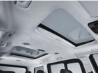
Dual sunroof (optional_wagon only)