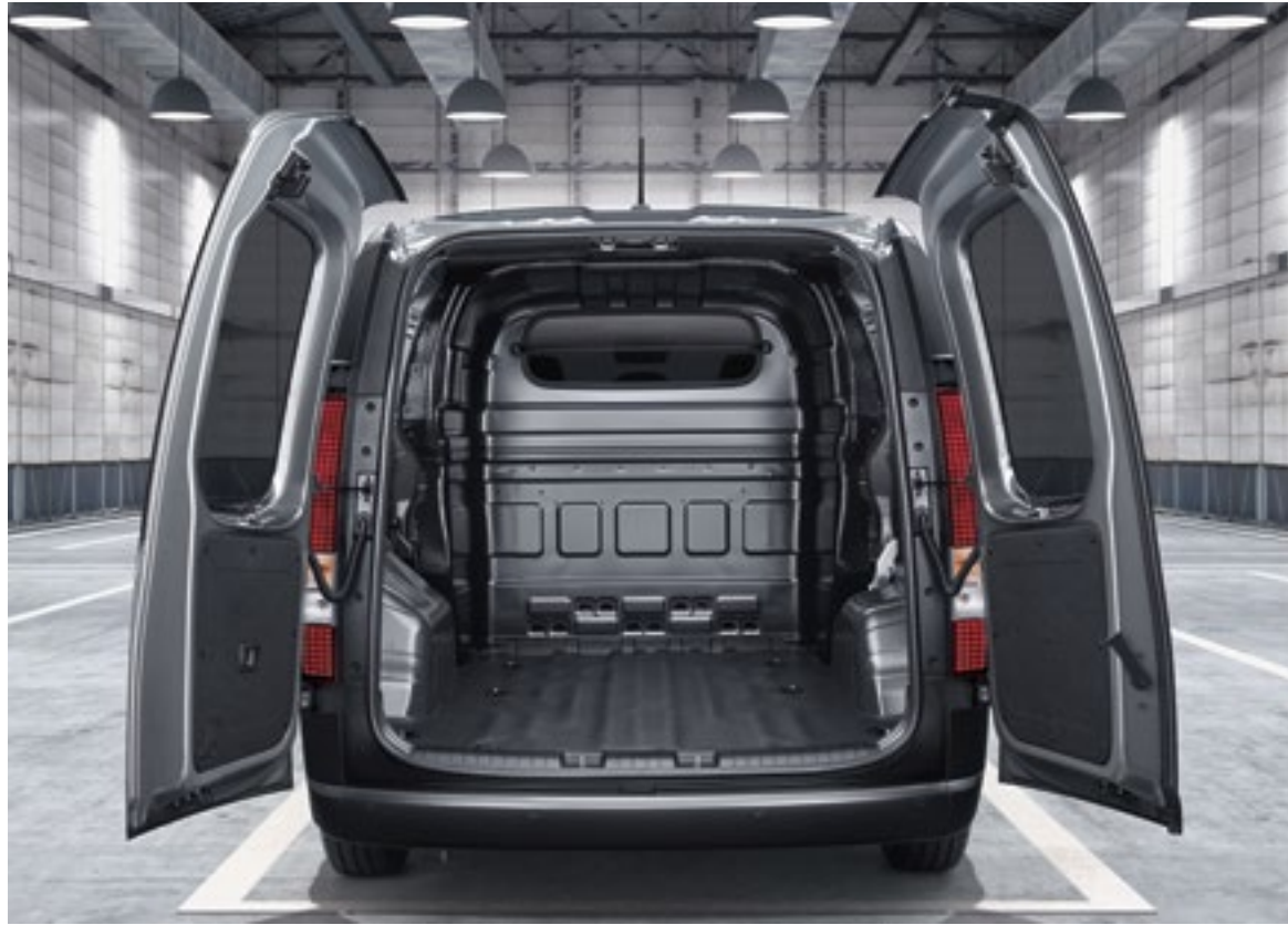
Twin swing doors (optional)