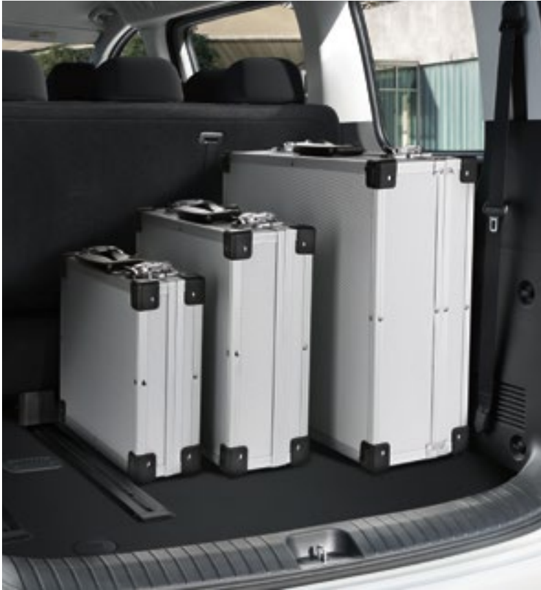
Long sliding seats* Increasing the range of the to-and-fro motion of the rear seat makes it easy to create extra luggage space and helps passengers get in and out more easily.

* Premium 9-seater, 11-seater (wagon) only