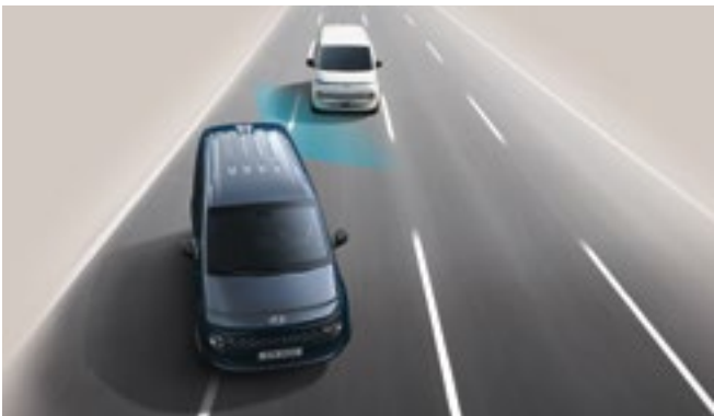
Lane Keeping Assist (LKA)

A front view camera detects lane markers and road edges helping prevent unintentional lane departures. When the vehicle strays from its lane (or road), the system sets off a visual and sound alarm and automatically steer the vehicle to prevent it from moving out of its lane (or road).