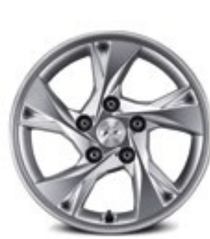
15" Alloy Wheel