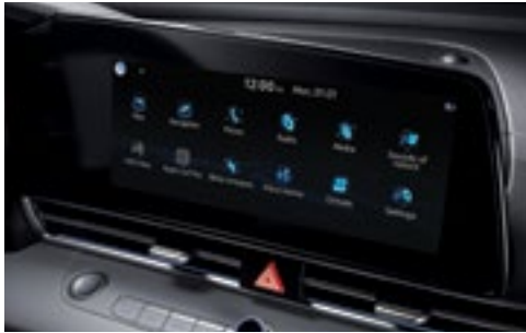
10.25" Navigation Display