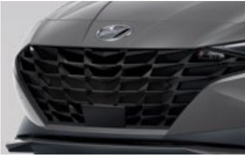
Black Radiator Grille