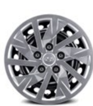
15" Steel Wheel & Wheel Cover