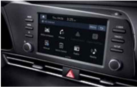
8" Display Audio System