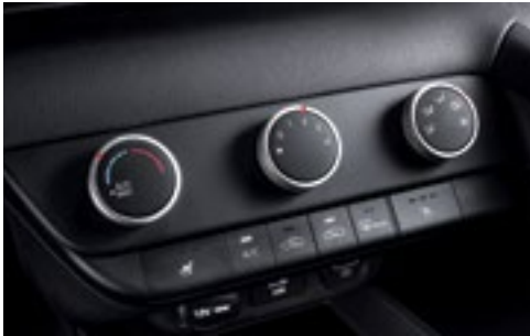
Manual Air Conditioner