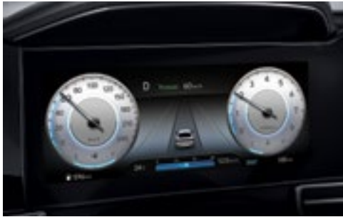
10.25" Full Color Cluster Display