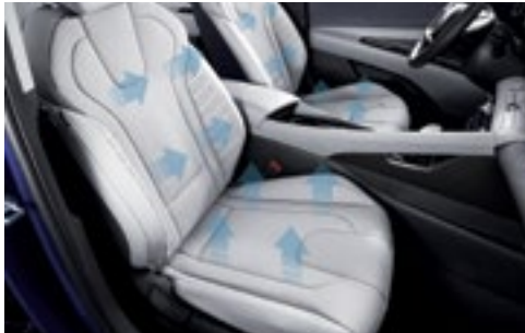
Ventilated Front Seats