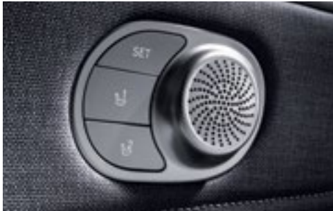
Memory System For Driver's Seat