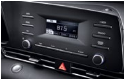
Basic Audio System