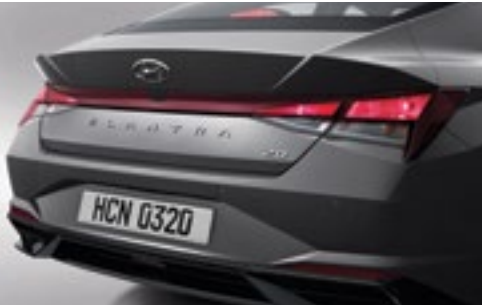
Bulb Rear Combination Lamp