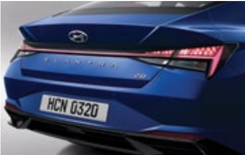
LED Rear Combination Lamp