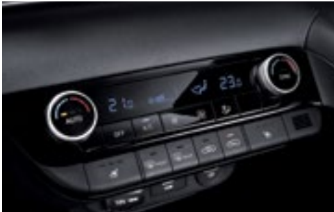
Dual Full Auto Air Conditioner