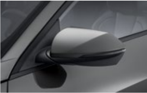
Exterior Sideview Mirrors (heated, power folding, LED turn signal indicators)