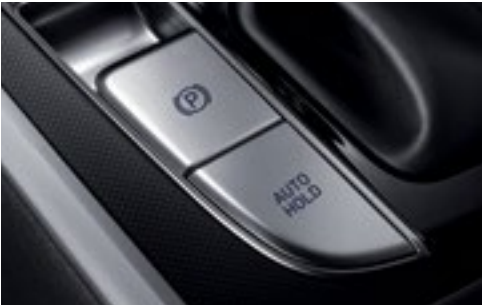
Electronic Parking Brake