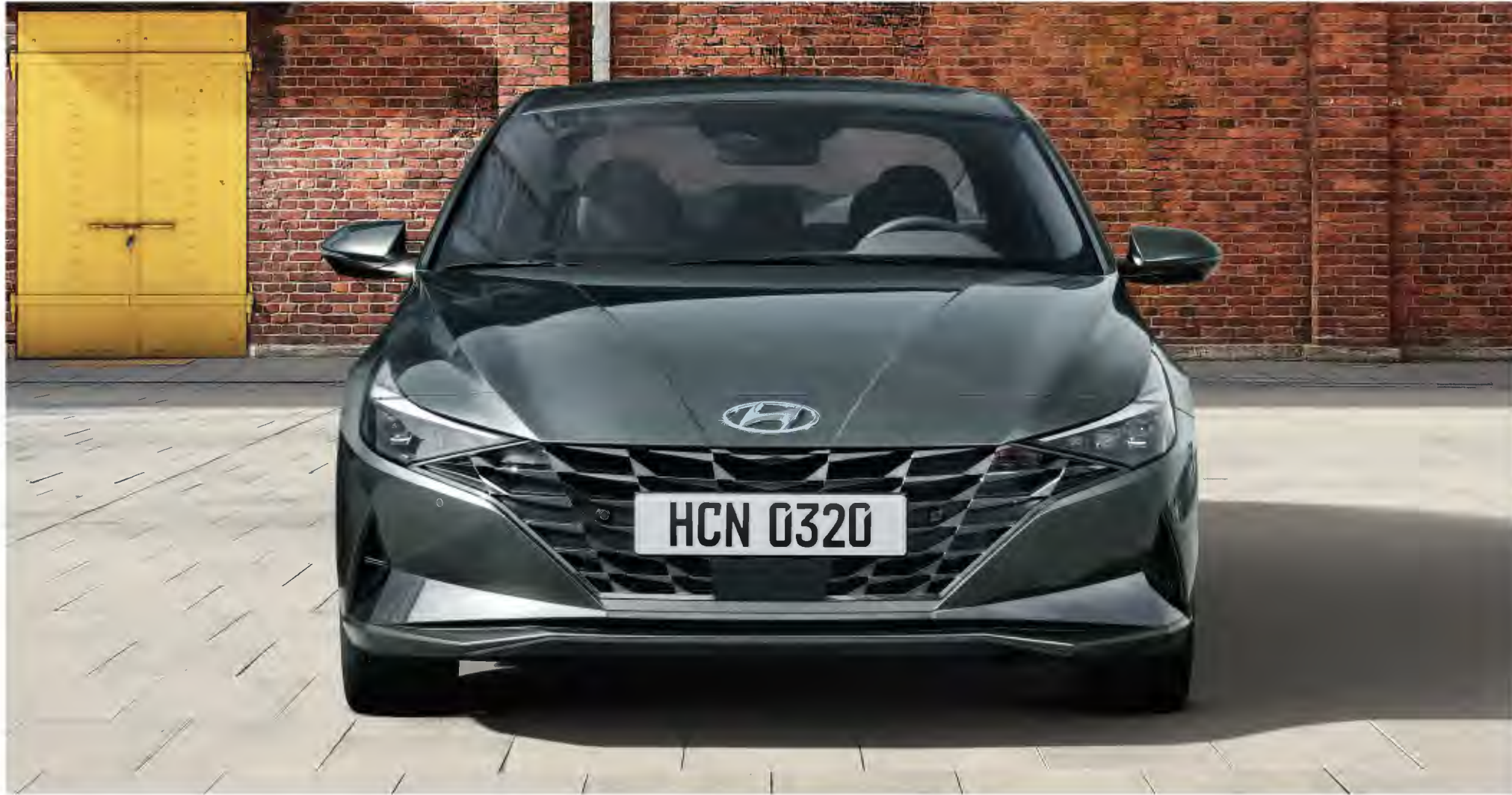
Parametric Jewel Pattern Grille

The stereoscopic Parametric Jewel-pattern design highlights the depth of the front grille, making it resemble diamond-cut gemstones, and the bold and elongated front headlights come together to give Elantra its front sporty look.