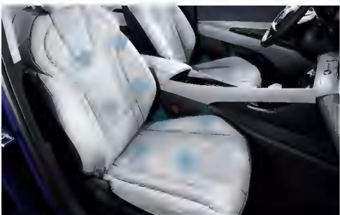
Ventilated Front Seats