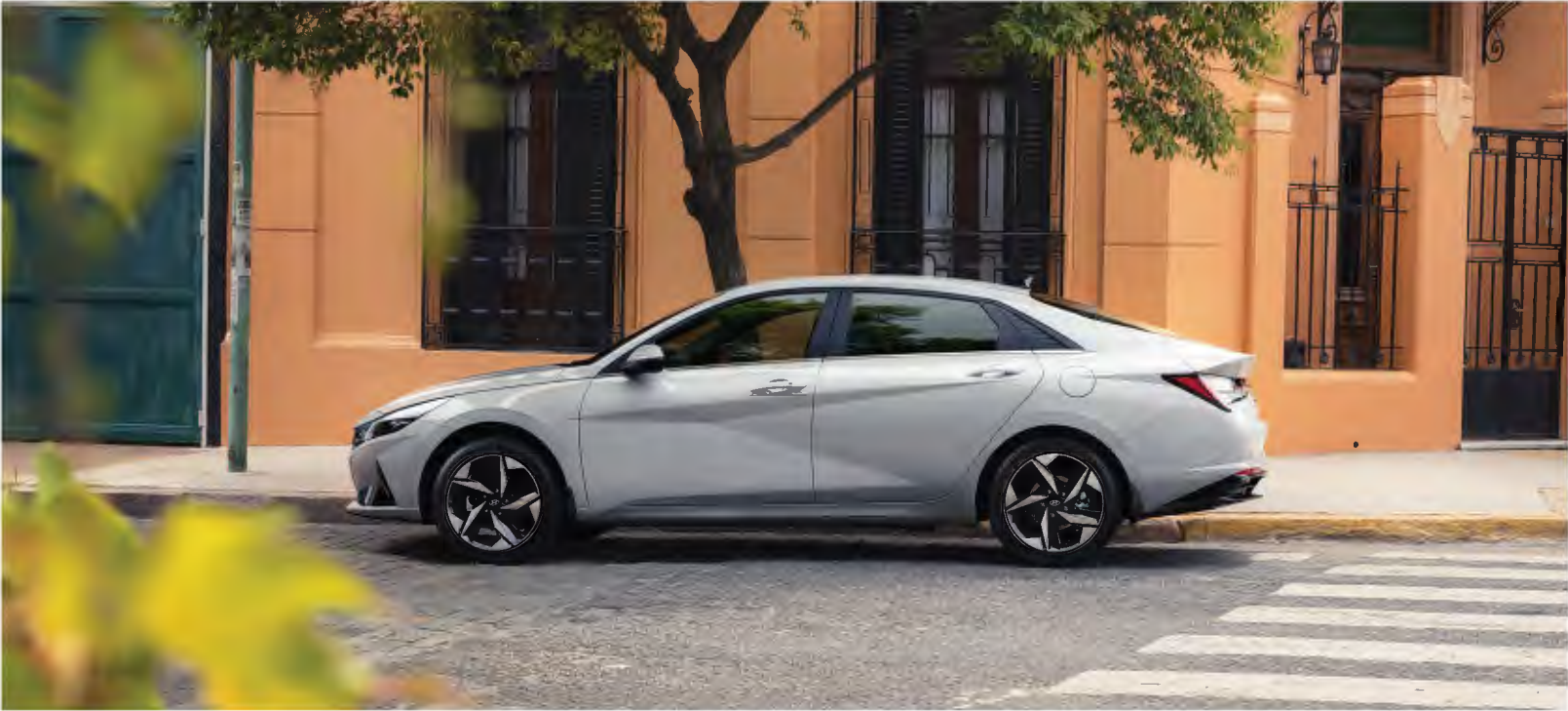
Parametric Jewel Surface Three sections emerge out of three bold-edged lines intersecting at a single point, creating three different colors of light.

The 'Parametric Dynamics' design accentuates geometric aesthetics of the elongated hood and sleek roof lines, completing the visionary and innovative style.