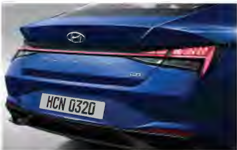
LED Rear Combination Lamp