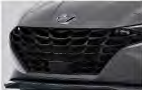
Black Radiator Grille