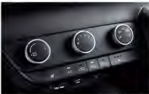
Manual Air Conditioner