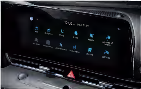
10.25" Navigation Display