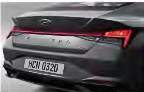
LED + Bulb Rear Combination Lamp