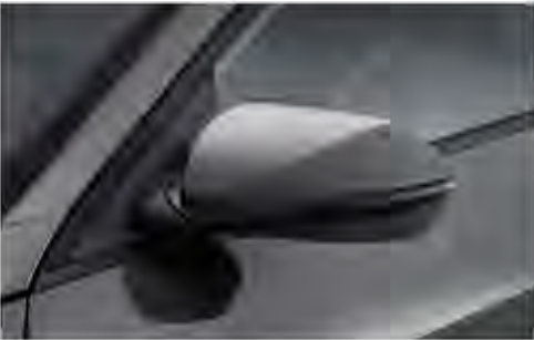
Exterior Sideview Mirrors (heated, power folding, LED turn signal indicators)