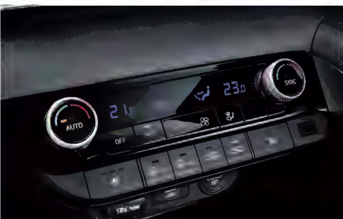
Dual Full Auto Air Conditioner