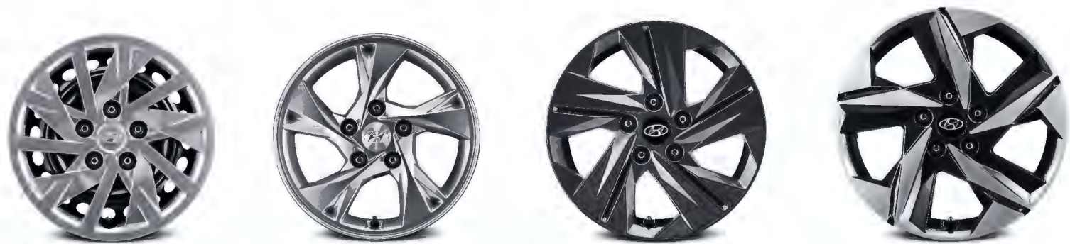
15" Steel Wheel & Wheel Cover