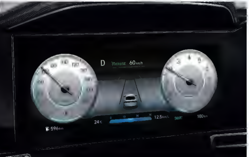
10.25" Full Color Cluster Display