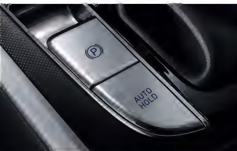
Electronic Parking Brake