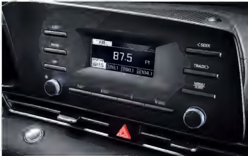
Basic Audio System