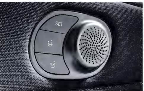
Memory System For Driver's Seat