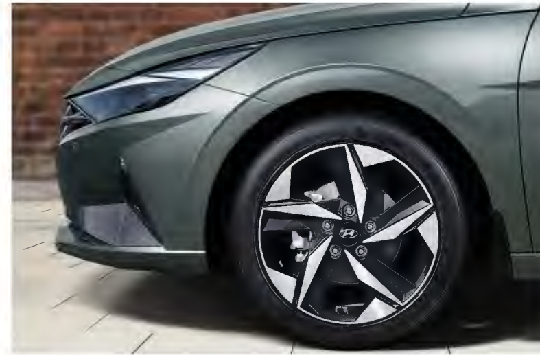
LED Headlights 17" Alloy Wheels & Tires