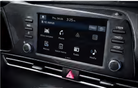
8" Display Audio System