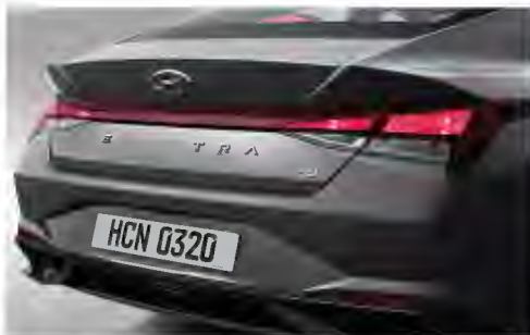
Bulb Rear Combination Lamp