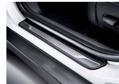
Door scuff plates