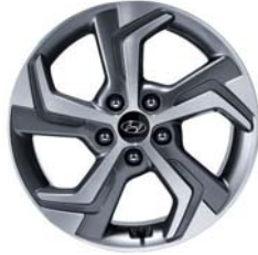
17" alloy wheels