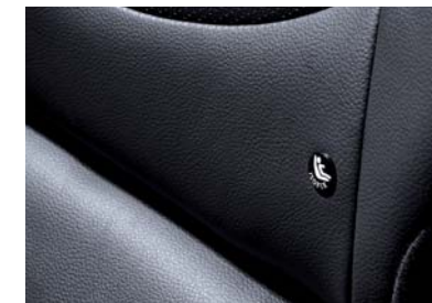
Child seat anchor