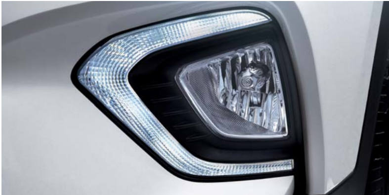
Projection headlamps Fog lamp with LED daytime running lights (DRL)