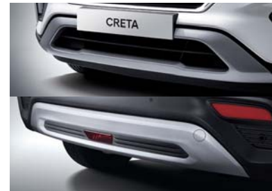
Front and rear skid plate