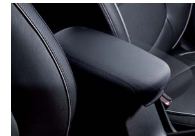
Sliding center console