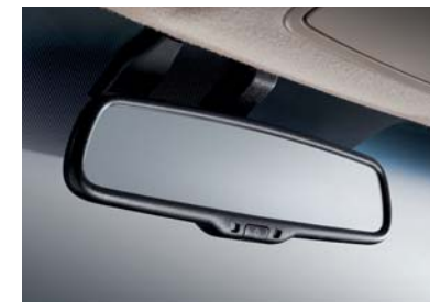
Electronic chromic mirror (ECM)