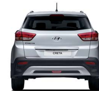
Wheel tread* 1,558