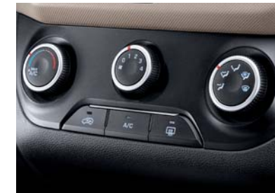
Manual air conditioner