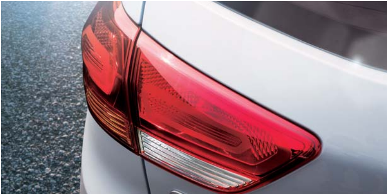
17" alloy wheels Rear combination lamps