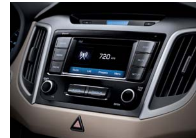
Premium AM / FM MP3 player