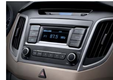
Basic AM / FM MP3 player