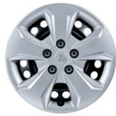
16" steel covers