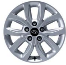
16" alloy wheels