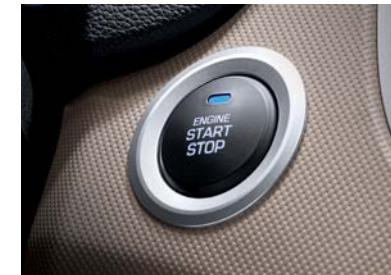
Push button start