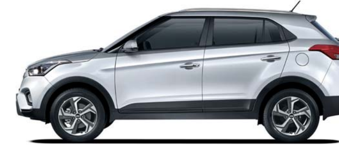
Wheel base 2,590 Overall length 4,280