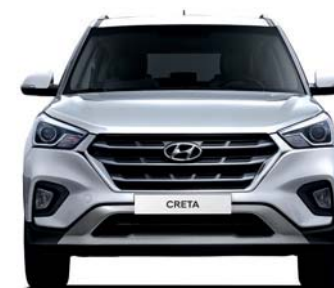
Wheel tread* 1,544.6 Overall width 1,780