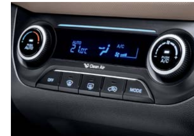
Full auto air conditioner