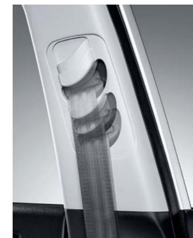
• Height-adjustable seat belt