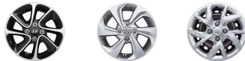
14" Alloy wheel (Two tone)