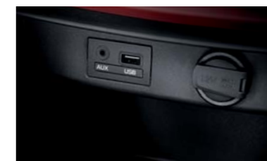
• Audio system • Auxiliary iPOD® & USB jack