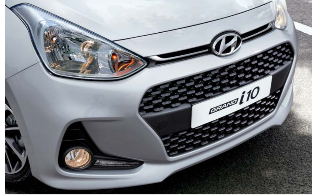
2. Large wraparound headlamps