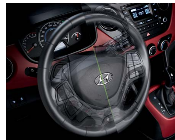
• Adjustable steering wheel