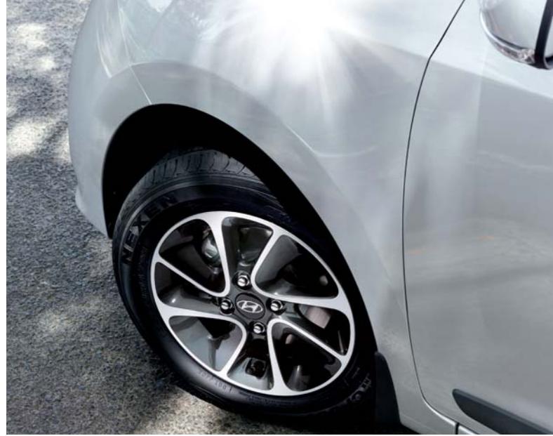
1. Stylish alloy wheels