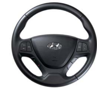
Smart steering wheel Intuitive fingertip command of the audio system using steering wheel controls is available for extra comfort, convenience and safety.

From power steering to powering your iPod®, the Grand i10 is loaded with high tech for total command and control. An in-dash LCD updates you with key driving information while four acoustically-tuned speakers work in concert with iPod®, MP3 and USB capabilities to deliver crystal-clear audio. Keeping you connected is standard Bluetooth® hands-free calling with audio controls mounted on the steering wheel for the ultimate in safety and convenience.