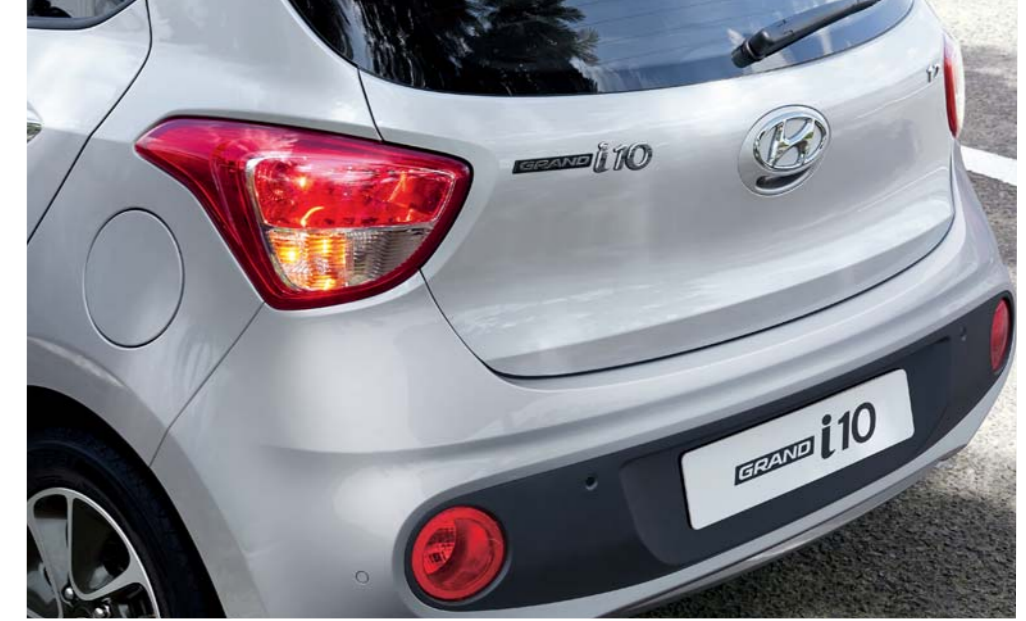
4. Large wraparound taillamps

It begins up-front with a pair of clear wraparound headlamps whose multi-focus reflectors combine with LED daytime running lamps to deliver powerful illumination. The back story reveals true urban sophistication: extra-large rear combination lamps maximize visibility while the chrome-plated H-logo cleverly conceals a tailgate latch and optional rear view camera.