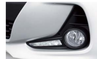
• Rear fog lamps • LED daytime running lights (DRL)