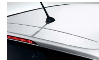
• Rear view camera • Micro roof antenna