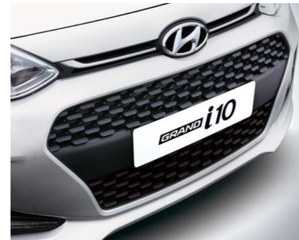
• New cascade grille