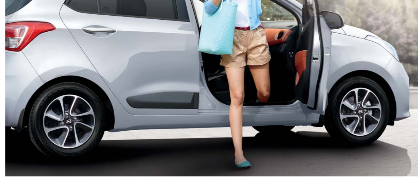
3. Lower step height