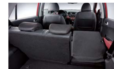
• ECM with rear view monitor • 60:40 Split rear seat