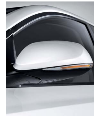
• Exterior mirror indicator repeaters